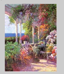
Http://www.equinox-andsolstice.com/html/ summer solstice.html