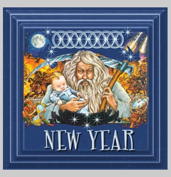
New Year's Day, Tuesday , January 1

5 p.m. on New Year's Eve Monday, December 31