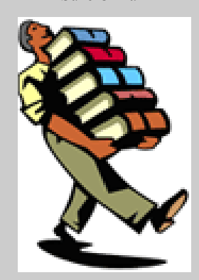
From Soviet to Putin & Back: The Dominance of Energy in Today's Russia.

The Road to Wealth: A Comprehensive Guide to Your Money. Suze Orman